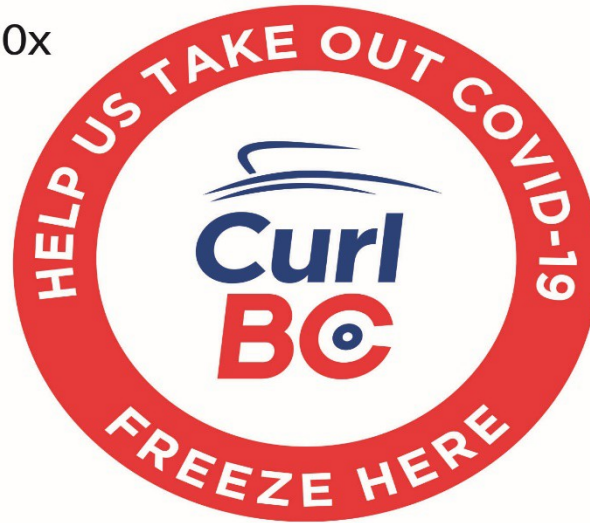
CURL BC "FREEZE HERE" - RED - 12" Diameter - Easy-In Textile LOGO