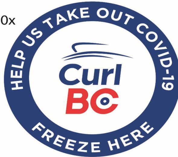
CURL BC "FREEZE HERE" - BLUE - 12" Diameter - Easy-In Textile LOGO